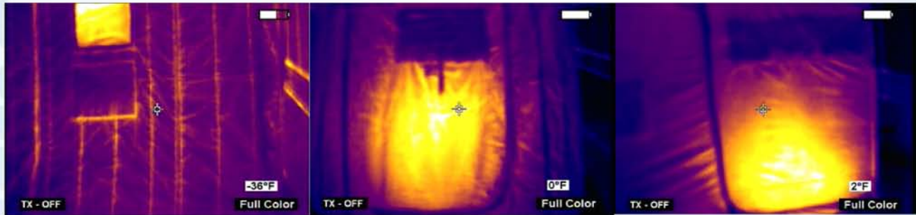
Traditional Poly/denier Fabric